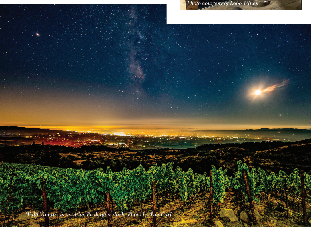
Wulff Vineyards on Atlas Peak after dark.