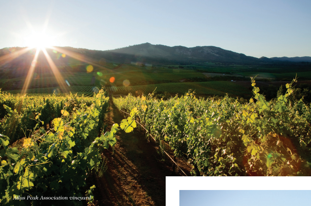
Atlas Peak Association vineyard

The region's micronutrient-rich volcanic soils combine with high altitude, San Francisco Bay-cleansed air to produce bold fruit with outstanding red-fruit characteristics. The result? Intensely flavored yet delicate and well-balanced wines of complexity and depth. To enjoy an Atlas Peak-derived wine is to instantly recognize its unique qualities, typically branded by bold structure and velvet silkiness. To enjoy an Atlas Peak wine is also to innately celebrate this region's fortitude.